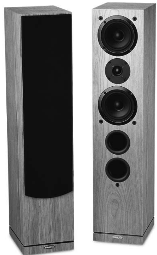
Sonique SAV-4 SE

All SE's are hand built to extreme standards, with tolerances that are well beyond any industry standard. Features include balanced timber veneered cabinets, selected drivers and matched crossover components. Providing even more style, better imaging, a more open and revealing mid-range, as well as a more controlled and defined low frequency response.